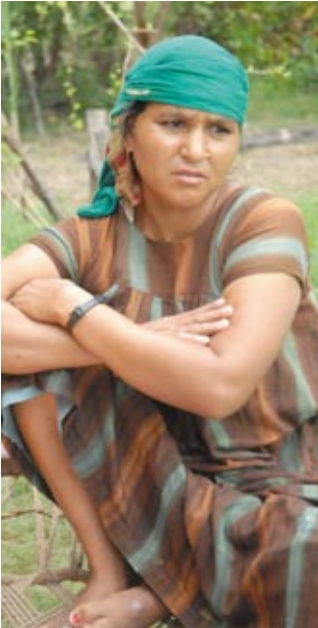
Binod Timilsena / ActionAid